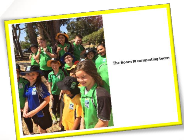
The Room 18 composting team

Look on NBPS Facebook to see more photos and information.